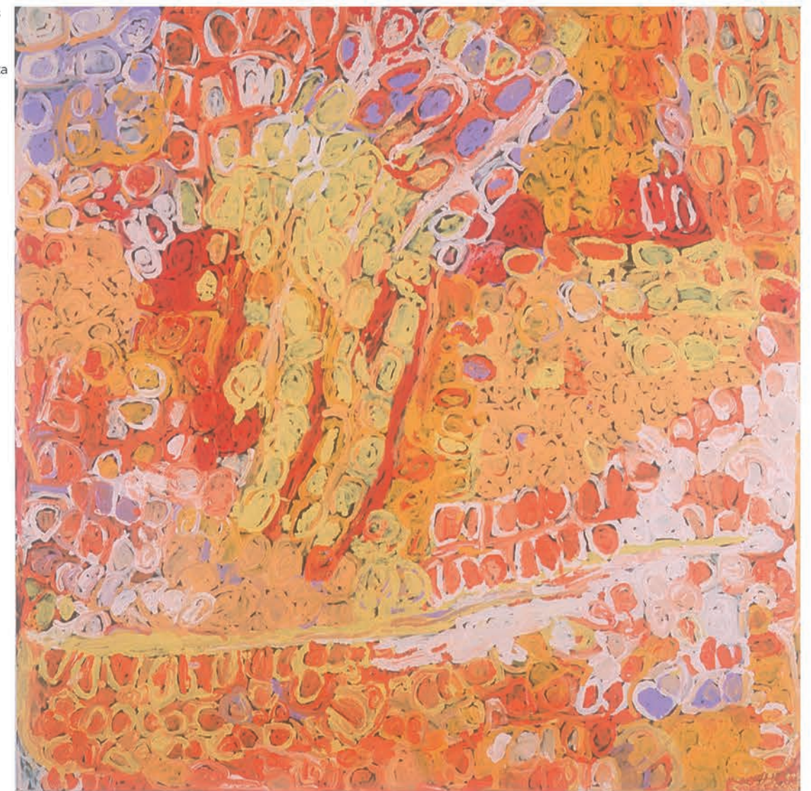
Right: Makinti Napanangka's painting 'Untitled' 1998. Acrylic pigment on linen. 1220 x 1200 mm. Napanangka spoke Pintupi all her life. Her country lies in the Lake Macdonald area of Central Australia, seen on the map near the later established communities of Kintore & Kiwirrkura. ©Papunya Tula Artists. Palya Art 0386.