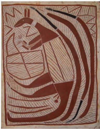
Philip Gudthaykudthay's painting 'Kangaroo and Black Nose Python' 2008. Earth pigments on canvas. 1730 x 1400 mm. A Galwanuk, Llyagalawumurr language Law man, Mr. Gudthaykudthay comes from the Ramingining area, Central Northern Arnhem Land. ©The Artist & Bula' bula Arts Palya Art 2585.