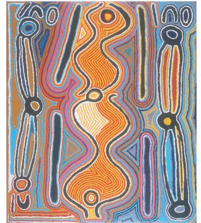
Judy Napangardi Watson's painting 'Ngalyipi Jukurrpa' (Vine Dreaming). 1998. Acrylic pigment on linen. 1070 x 940 mm. Napangardi spoke Warlpiri and lived and worked in between Lajamanu and Yuendumu, Central Australia. ©The Artist & Warlukurlangu Artists. Palya Art 0278.