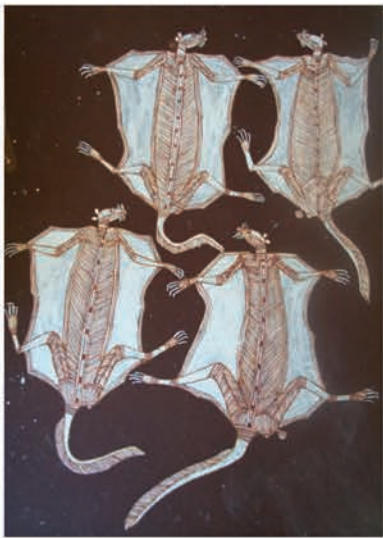
Wamud Namok AO (Bardayal "Lofty" Nadjamerrek). Painting, untitled. 2001. Natural ochres on paper. 760 x 1020 mm. From Gunbalanya (Oenpelli), Western Arnhem Land, Wamud Namok spoke both Kunwinjku & Kundedjnenghmi languages. ©The Artist & Injalak Arts & Crafts. Palya Art 1138.