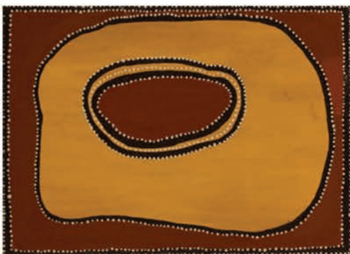
Rover Thomas's painting 'Wolf Creek Crater' 1996. Natural earth ochres on Belgian linen. 505 x 765 mm. Speaking Kukatja & Wankajunga, Rover was born near Kunawarritji (Well 33) then lived in East Kimberley. ©Rover Thomas. Palya Art 0049